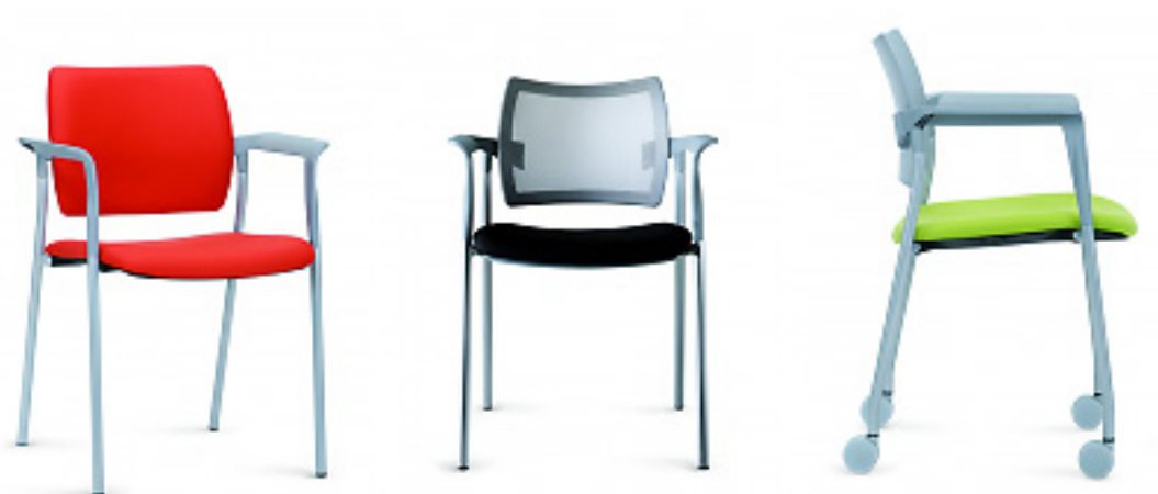
seat & backrest upholstered