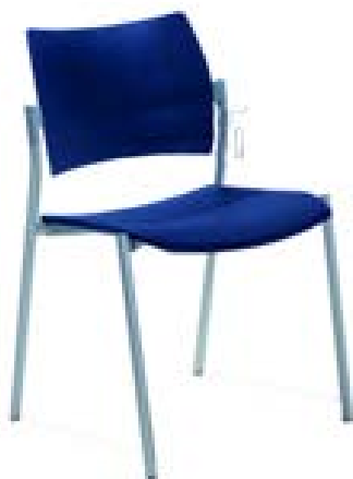
polypropylene seat & backrest