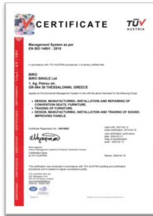
✓ EN ISO 14001:2015