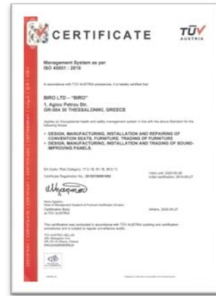
✓ ISO 45001:2018