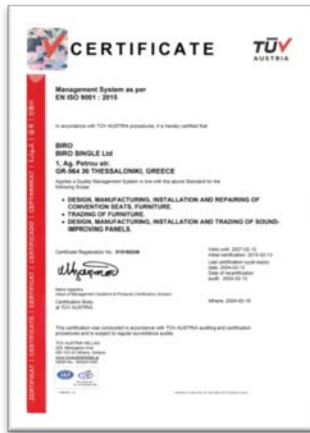
✓ EN ISO 9001:2015

BIRO is ISO 9001, ISO 14001 and ISO 45001 certificated.