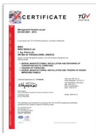
✓ EN ISO 9001:2015

BIRO is ISO 9001, ISO 14001 and ISO 45001 certificated.