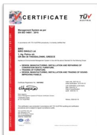
✓ EN ISO 14001:2015