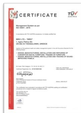
✓ ISO 45001:2018